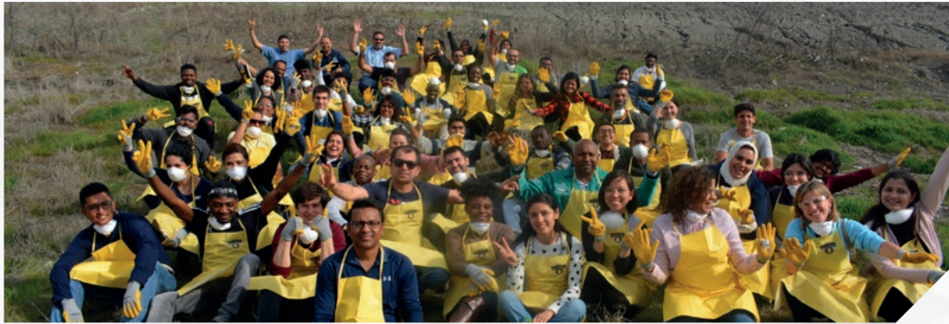
13 Jan 2020 - 24 Jan 2020 , Arlington, Texas, United States. ISWA-SWIS Winter School