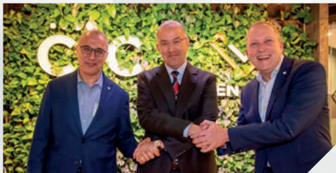
13 January 2020 , Rotterdam ISWA Office Opening